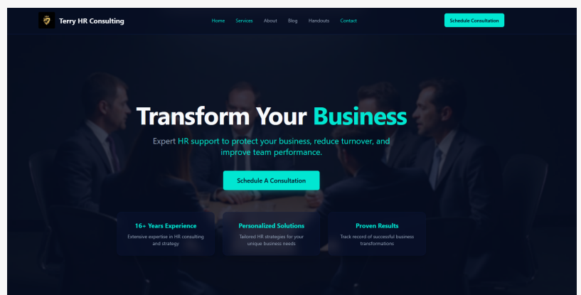
Terry HR Consulting Website