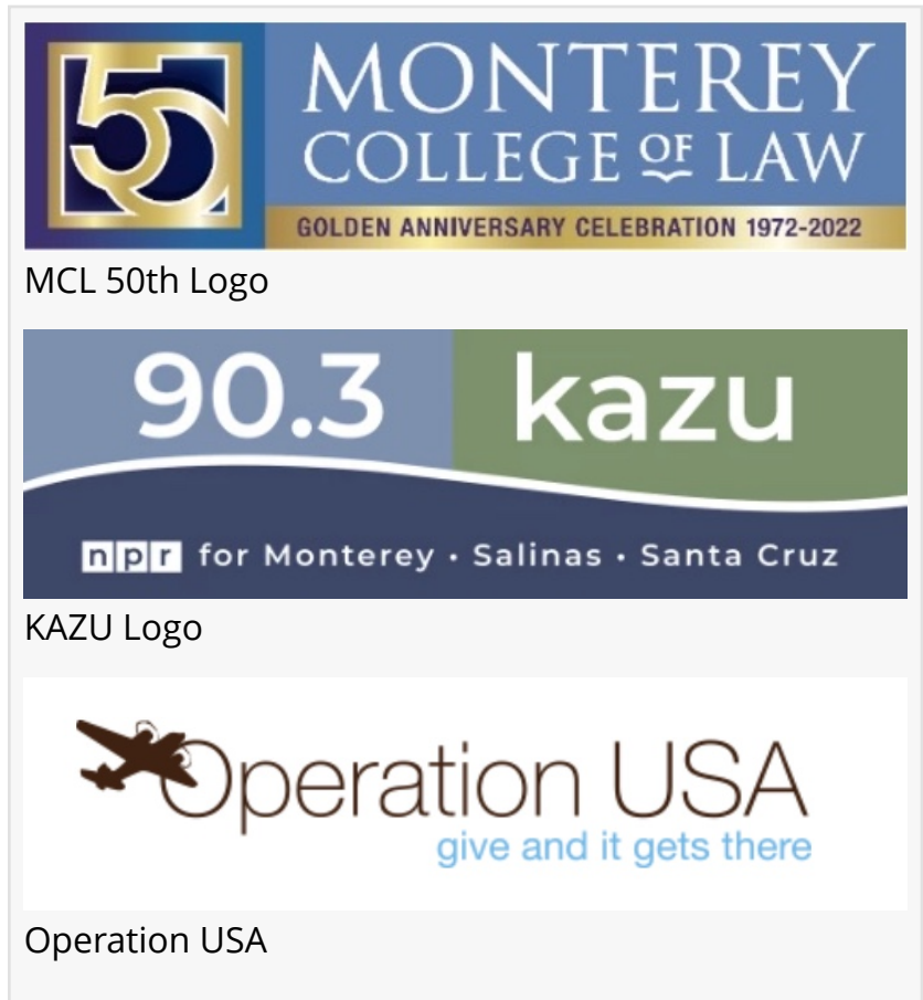
MCL 50th Logo

KAZU 90.3 radio and SideBarMedia are excited to collaborate to add SideBar: Optimism in Action podcast to KAZU's digital programming on the station's website ( www.kazu.org/sidebar ). KAZU is the NPR affiliate station for Monterey, Salinas, and Santa Cruz. The SideBar: Optimism in Action podcast - sponsored by Monterey College of Law, a long-standing nonprofit sponsor of KAZU 90.3 radio - has become the first non-newscast, locally produced podcast featured on the KAZU website and mobile application.