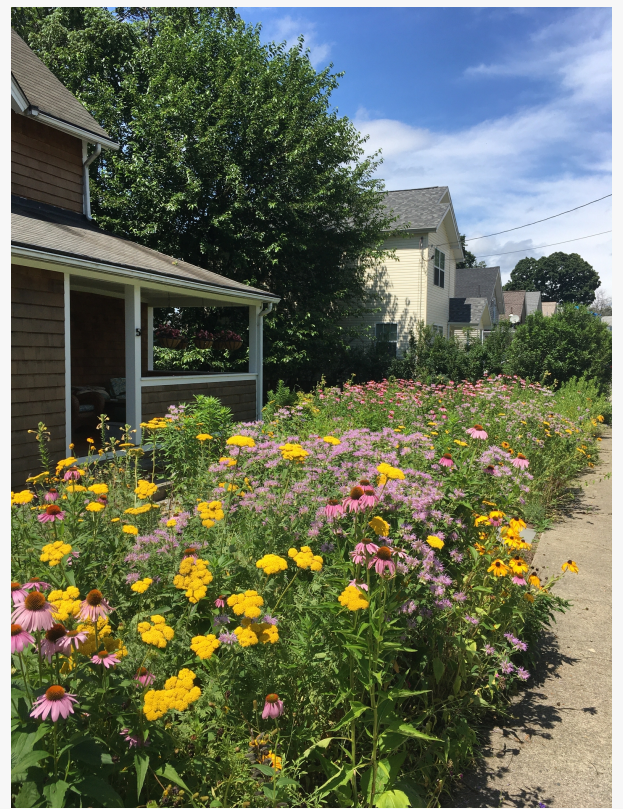
A front yard planting of native and adapted wildflowers replaces traditional lawn, offering seasonal color, pollinator support, and reduced maintenance in a residential setting.

To support better-informed decisions, American Meadows provides educational resources, including a native plant and seed glossary , regional planting guides, and a trust and transparency page outlining how seeds and mixes are sourced and labeled.