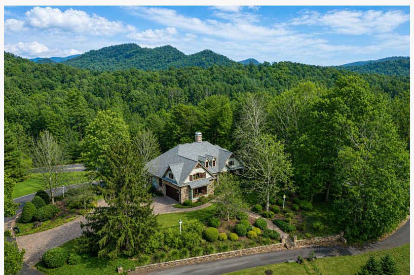
The Cliffs Valley Estate: 209 Courtside Trail, Travelers Rest, SC

TRAVELERS REST, SC, UNITED STATES, May 6, 2026 /EINPresswire.com/ -- Interluxe Auctions, the premier online luxury real estate auction marketplace, is pleased to present the opportunity to bid your price on a private mountain retreat in one of the region's most sought-after communities. Previously listed for $1.7 million, The Cliffs Valley Estate will be sold to the highest bidder at or above $1 million during the online auction beginning Tuesday, May 19, 2026, at 12:00 p.m. EDT. Spanning 3.21± acres across four combined lots within The Cliffs Valley, a premier Blue Ridge Mountain community known for its championship golf, expansive amenities, and elevated private club lifestyle.