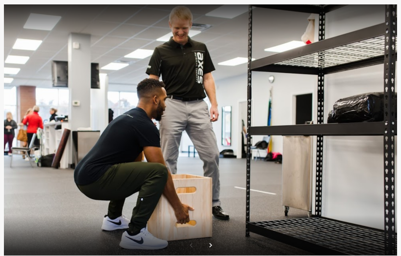
Axes Physical Therapy

No referral required, thanks to Missouri's Direct Access law