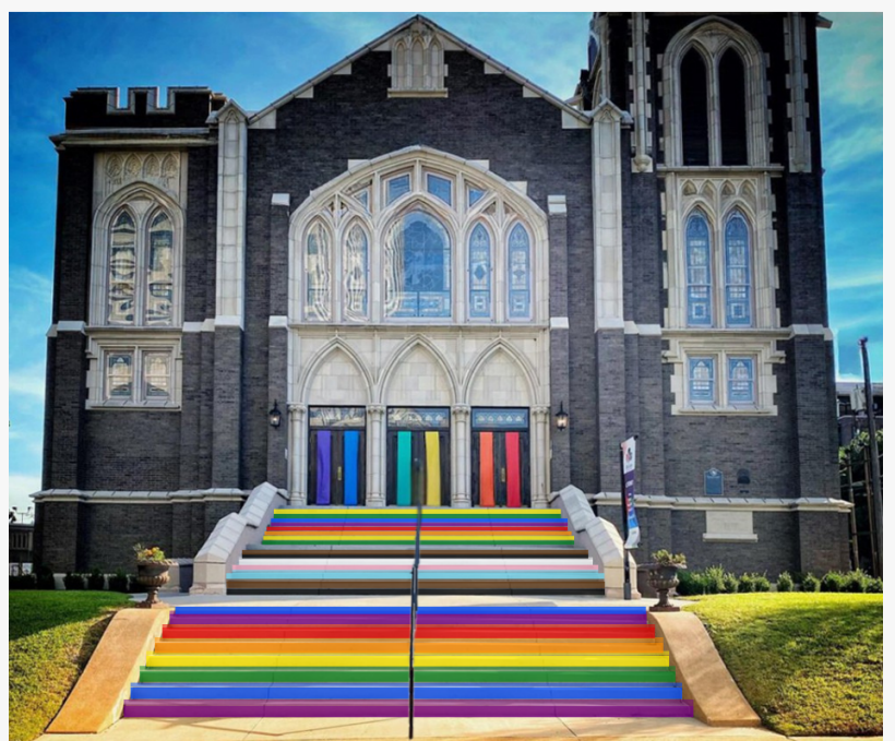
Oak Lawn UMC Dallas

DALLAS, TX, UNITED STATES, May 6, 2026 /EINPresswire.com/ -- On Thursday, May 14, 2026, Oak Lawn United Methodist Church will toll its bell 600 times beginning at 6:00 p.m., marking a solemn milestone in Texas history and calling the community into remembrance, prayer, and action. Following the bell tolling, the church will host a Service of Prayer and Justice at 6:30 p.m. in the Sanctuary, open to all.