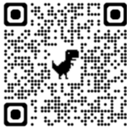
QR Code for information and signing up.

The walkathon also honors the spirit of both Mother's Day and Father's Day, recognizing the essential role of families, caregivers, mentors, and elders in nurturing peace, resilience, and