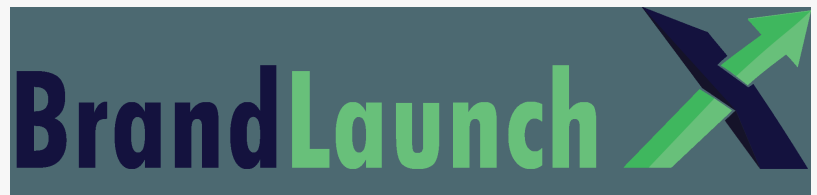
BrandLaunchX AI-First Launch Impact Navigation

BrandLaunchX attributes launch underperformance not to the quality of the therapies involved, but to the operational complexity of bringing them to market. A modern therapeutic launch requires coordination across 12 to 16 specialist functions including regulatory affairs, market access, medical affairs, health economics, commercial operations, and supply chain, across multiple geographies and time zones. Most organisations currently manage this coordination using manual tools including spreadsheets, milestone trackers, and retrospective reporting dashboards.