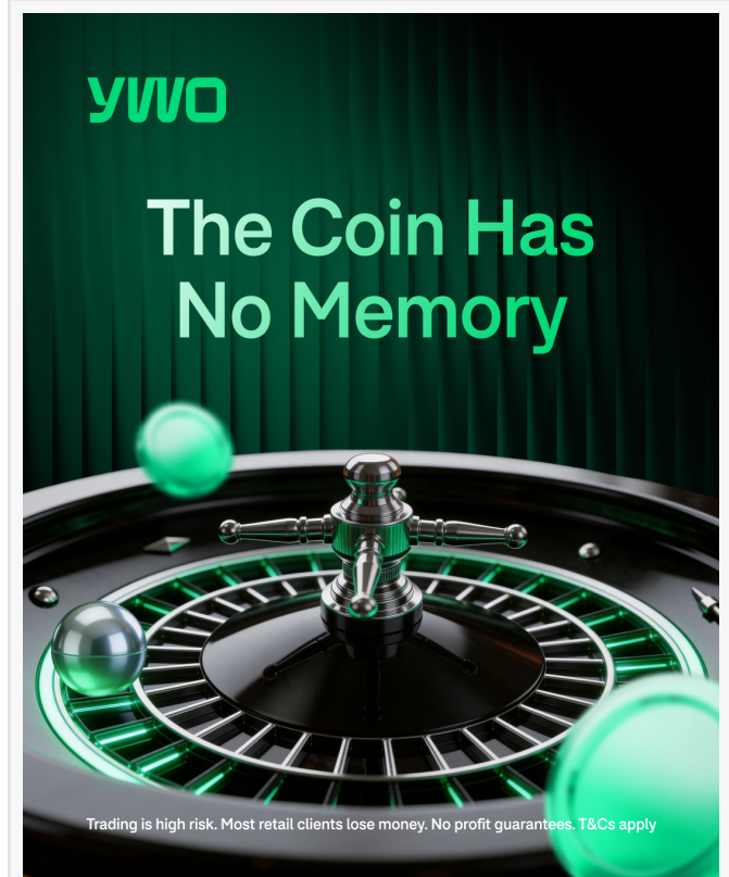
YWO Trading Platform