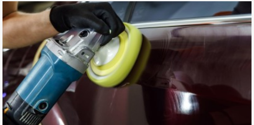
mobile vehicle detailing company