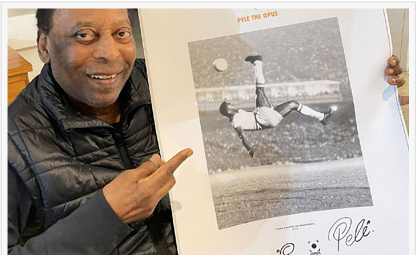
Pele holding up one of his Hand-Signed Signature Sheets