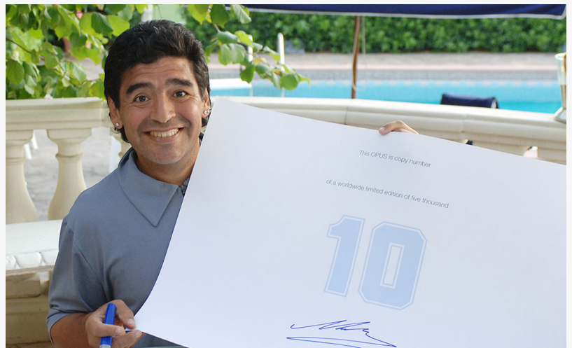
Maradona holding up one of his Hand-Signed Signature Sheets