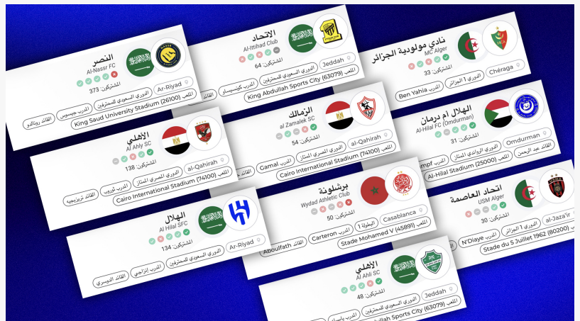
The most-followed Arab clubs on Tribuna.com, led by Al-Nassr, Al Ahly and Al-Hilal