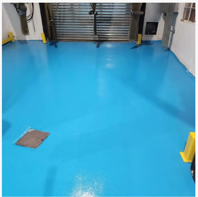
Commercial Kitchen Flooring Systems

This press release can be viewed online at: https://www.einpresswire.com/article/910806930