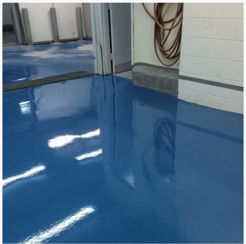
Epoxy Flooring Tri-State Contractor

"A seamless kitchen floor is more than just a surface; it's a commitment to hygiene and professional standards that inspectors and staff recognize immediately," said a spokesperson for High Performance Systems. "Our goal is to provide a long-term, state-of-the-art solution that lets restaurant owners focus on their craft, not their floors."