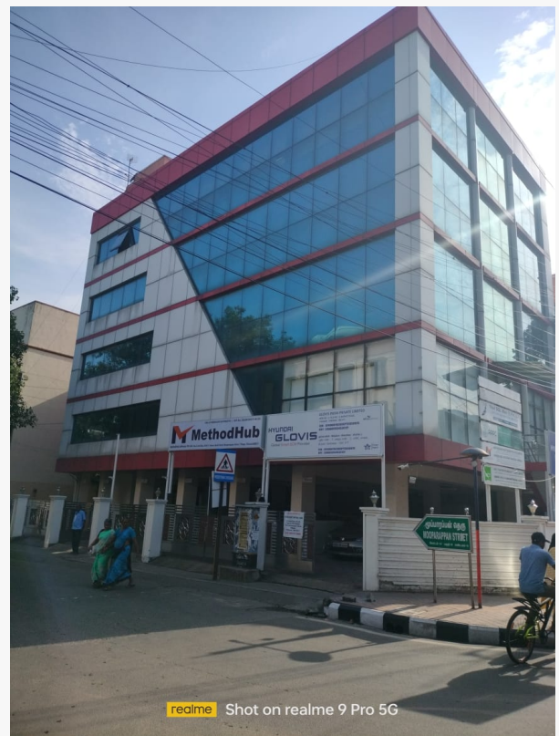
MethodHub Chennai Center

MethodHub is a publicly listed, global technology services company that helps enterprises modernize, scale, and accelerate their digital transformation journeys. With entities in US, Canada, India and Thailand, MethodHub operates with a team of over 500 skilled professionals serving enterprise clients worldwide. With AI-driven platform services under the brand AI-centric solutions across verticals and business functions. MethodHub's traditional IT offering includes Cloud Engineering, Data , Cybersecurity, and ERP/CRM Integration. The engagement models extend from tactical staffing to technology consulting, project delivery, managed services and platform engineering. Guided by a strong governance framework and validated by ISO 27001, ISO 9001, SOC 2 Type II, and HIPAA HITECH certifications, MethodHub is recognized for its transparency, customer centricity, process maturity and operational excellence. With deep industry expertise across BFSI, Healthcare, Oil & Gas/Energy, Telecom and