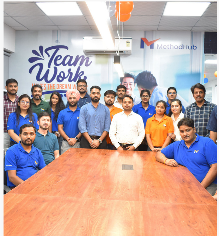
MethodHub Mohali Center