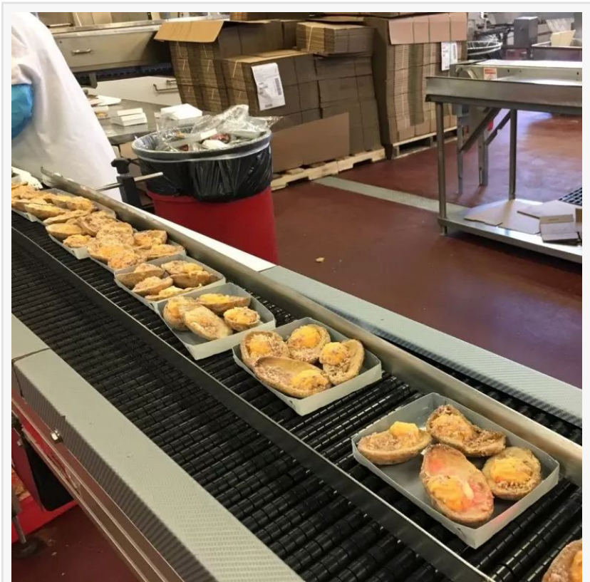
Food and Beverage Flooring

This press release can be viewed online at: https://www.einpresswire.com/article/910815061