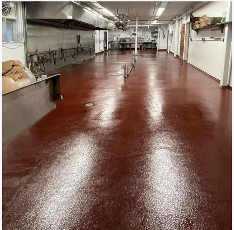
Restaurant Kitchen Flooring