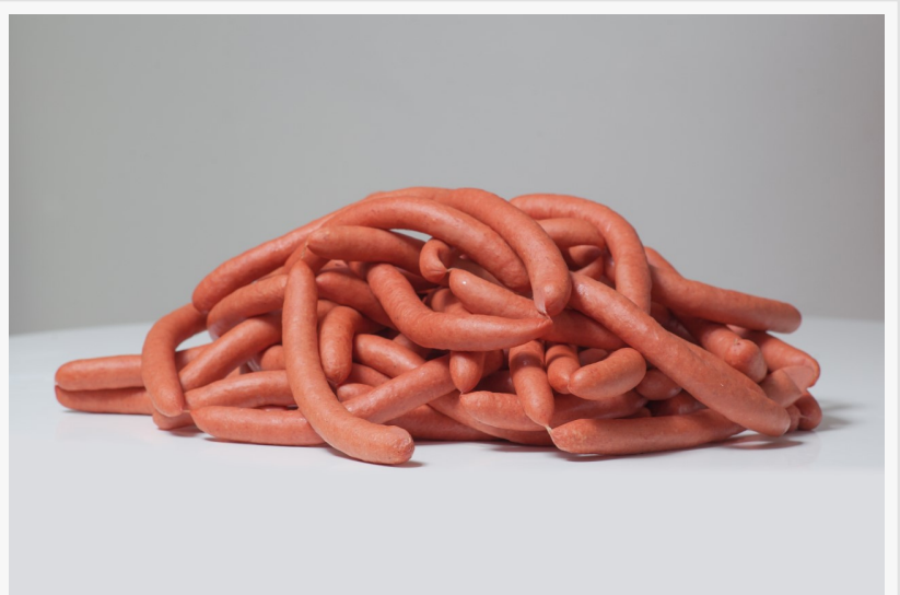
Ralph will be serving up the Beefy Butcher Dog® at the NRA show.