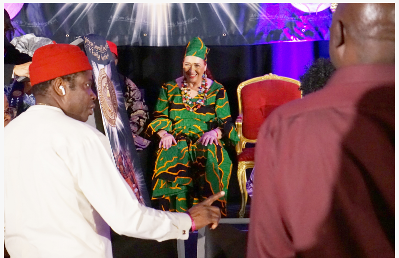
Family Induction Ceremony