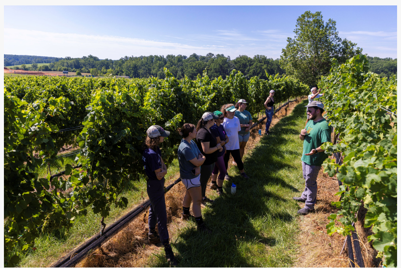
17 Acres of Vineyard

Communications and Marketing Sweet Briar College +14343816240 ext.