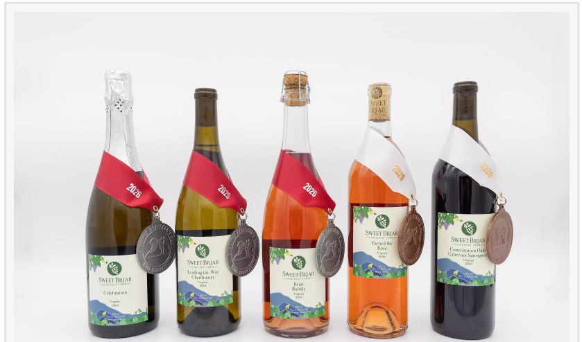
Sweet Briar College Farm celebrates five wines being recognized in this year's Governor's Cup.

Sweet Briar's wines are crafted from grapes grown in nearly 18 acres of vineyard tracts in two separate locations on the College's campus. The vineyards include merlot, chardonnay, cabernet sauvignon, and cabernet franc grapes.