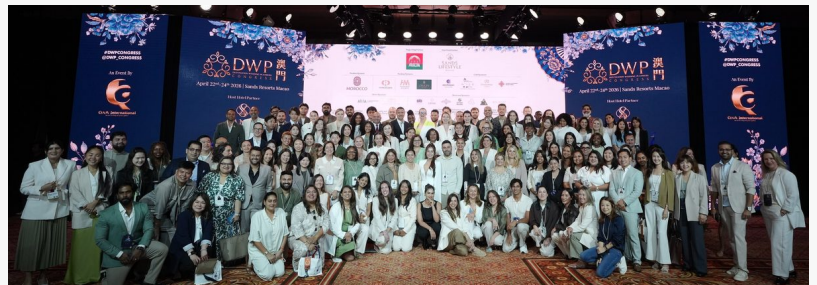
DWP Congress 2026

The DWP Congress 2026 is a must-attend event for anyone in the wellness and health industry. It provides a unique opportunity to learn from the world's leading experts and influencers, network with industry professionals, and discover the latest trends and innovations in the sector. The event is a must-attend for anyone in the wellness and health industry.