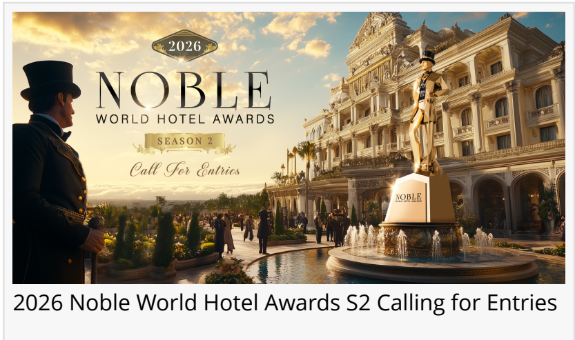
2026 Noble World Hotel Awards S2 Calling for Entries

Collectively, they represent a shift toward integrated hospitality experiences, where leadership and service delivery are evaluated as a unified standard.