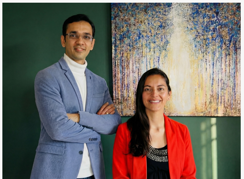
Elisium Art - Founding Team