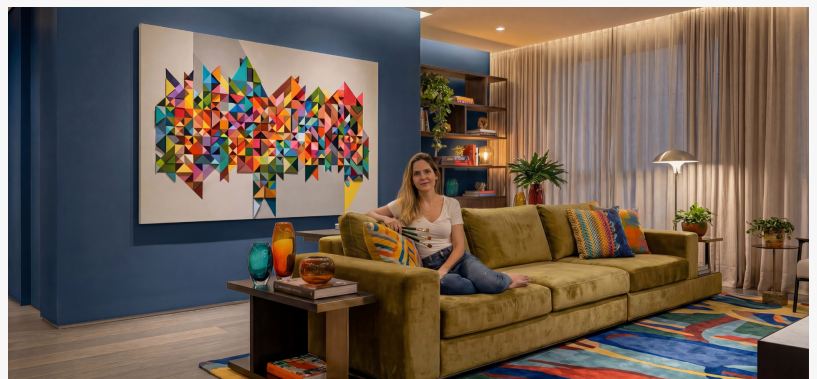
Elisium Art - Fusion Pop