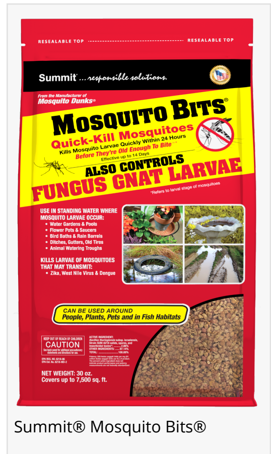
Summit® Mosquito Bits®