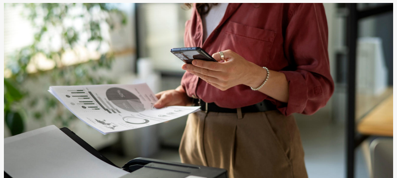
User release a Microsoft Universal Print job using a card reader

The collateral damage to the print management industry created by WPP will be significant and