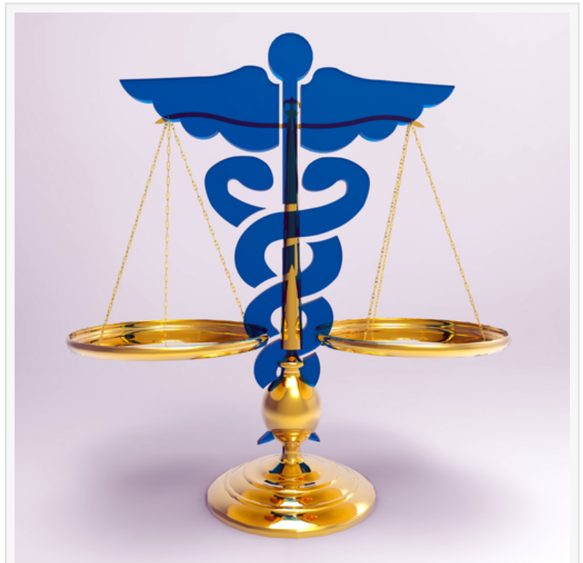
HEALTH CARE MEDICAL MALPRACTICE CONSULTING CERTIFICATION

WARREN, OH, UNITED STATES, May 7, 2026 /EINPresswire.com/ -- The American Institute of Health Care Professionals has announced the offering of a comprehensive Health Care Legal and Malpractice Consulting Certification program today. This new credentialing pathway is designed for qualified health care practitioners seeking to expand their expertise and advance their careers in the specialized field of medical malpractice consulting. By completing this rigorous continuing education program, professionals can enhance their marketability and achieve national recognition for their advanced knowledge.