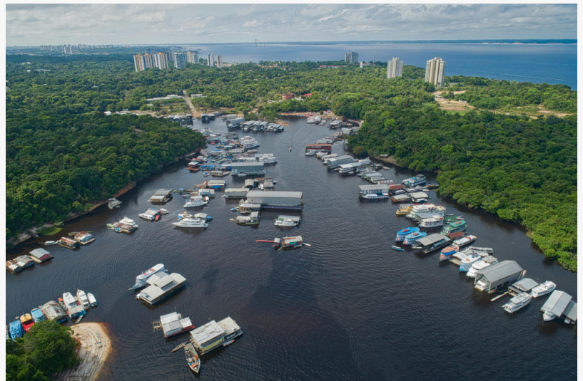
Manaus will host the Malacara Race