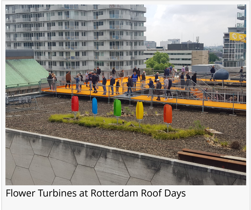
Flower Turbines at Rotterdam Roof Days

#windenergy #windpower #renewableenergy #cleanenergy #distributedenergy #localenergy #energysolutions #sustainableenergy #greenenergy #decarbonization #verticalaxiswindturbine #smallwindturbine #urbanwind #microgridenergy #onsiteenergy #commercialwind #rooftopwind #windenergytechnology #smartenergy #energyinnovation #airportenergy #datacenterenergy #industrialenergy #campusenergy #factoryenergy #portenergy #marinaenergy #evcharginginfrastructure #energyefficiency #sustainabilitysolutions #flowerturbines #flowerpowerenergy #futureofenergy #nextgenenergy #climatetechnology #energyinnovation #sustainableinfrastructure #renewableenergyUK #windenergyUK #cleanenergyUK #greenenergyUK #windturbinesUK #distributedenergyUK #sustainabilityUK #netzeroUK #energytransitionUK #madeinUK #windturbinesinUK #UKrenewables #UKenergy #verticalaxiswindturbine #smallverticalaxiswindturbine #bestsmallverticalaxiswindturbine #solarenergy #solarPV #photovoltaic