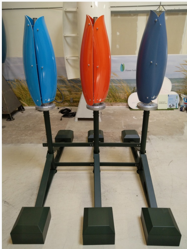
Colored EcoRoof Energy Hub

This shows how each turbine produces more energy as another turbine is clustered. 5 Flower Turbines together produce 228% more power than 5 separate turbines.