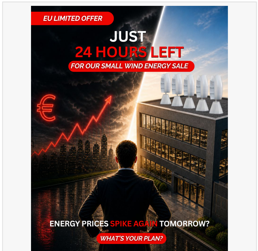
Last Day of EU Sale

Rules of the sale: The sale is valid in EU and EU-associated countries only with 220-240 voltages. To initiate an order, email support.eu@flowerturbines.com with your delivery and contact details and we will send you an invoice. Shipping is paid for separately when the goods are ready for delivery.