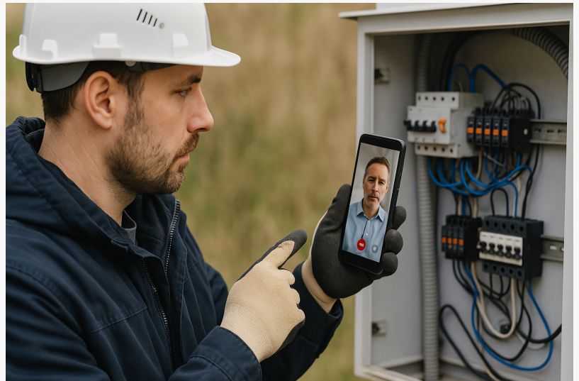
Field worked on a Brosix video call