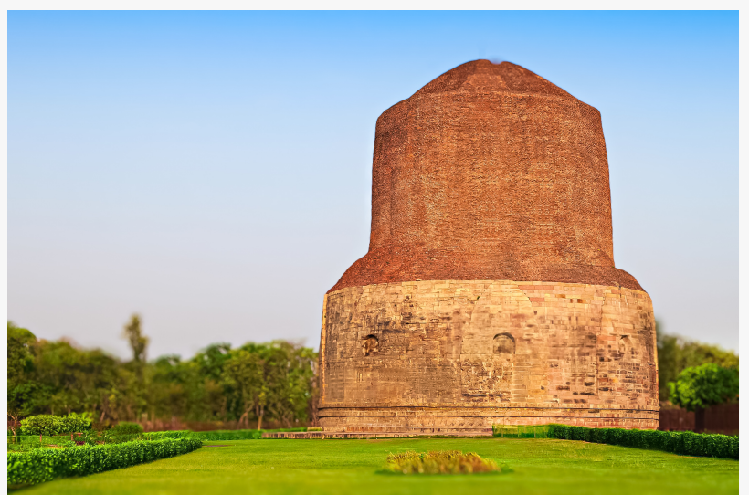
Dhamek Stupa, Sarnath

With its sacred heritage, expanding tourism infrastructure and deep spiritual resonance, Uttar Pradesh continues to strengthen its position as one of the world's leading Buddhist tourism destinations inviting travelers from across the globe to walk the path of enlightenment where it all began.