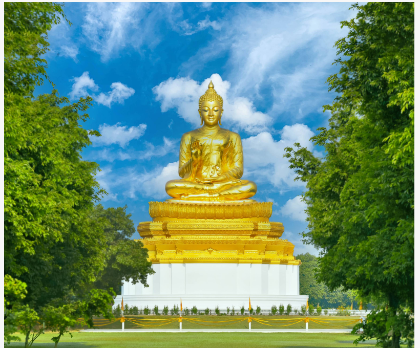
Statue of Lord Buddha at the International Meditation Center in Shravasti District