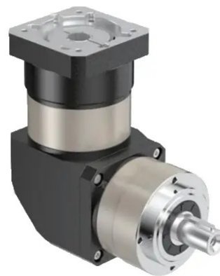
Round flange right angle planetary gear reducer for servomotor GER series