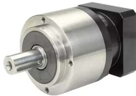
GE090 series Round flange 90mm Planetary Gearbox For Servo Motor

GPG is part of Taibang Motor Industry Group Co. Ltd., an industry-leading provider of gear motors and motion control solutions since 1990. For over three decades, Taibang has developed leading-edge capabilities along the entire value chain including R&D, manufacturing, and quality