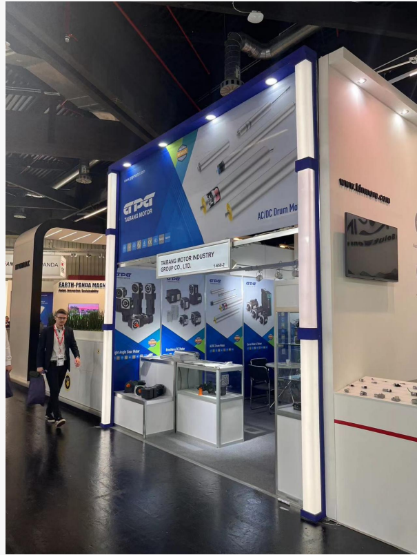
one of the world's premier exhibitions for industrial automation

FAQ - Frequently Asked Questions from Show Attendees