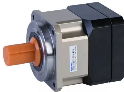
Low Noise Parallel Helical Shaft Planetary Gearbox For Servo Motor