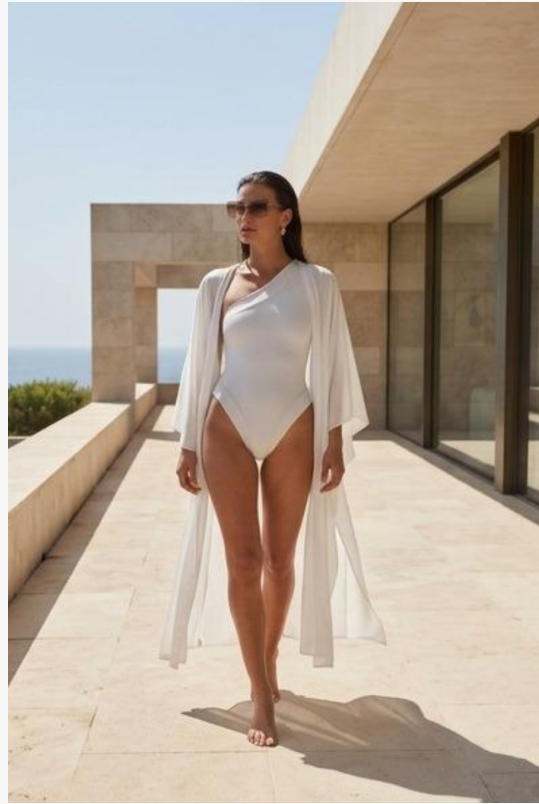
Tamara hipc couture suit featuring hipc couture

Cocoraille is a Dubai-based female-founded premium swimwear brand launched in 2026. Built around the proprietary HipCouture® silhouette system, the brand creates bikinis and one-pieces handmade in Brazil using premium