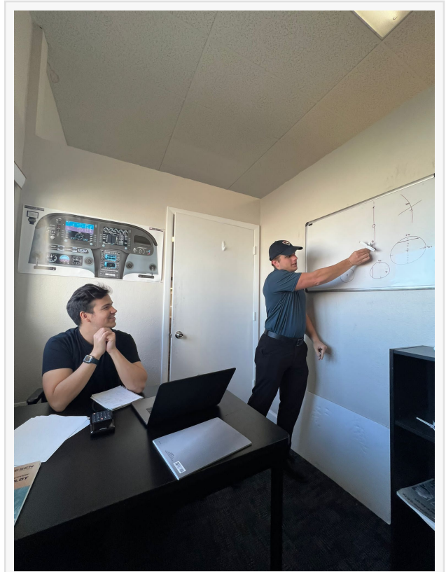
Florida Aviation Academy student and Instructor