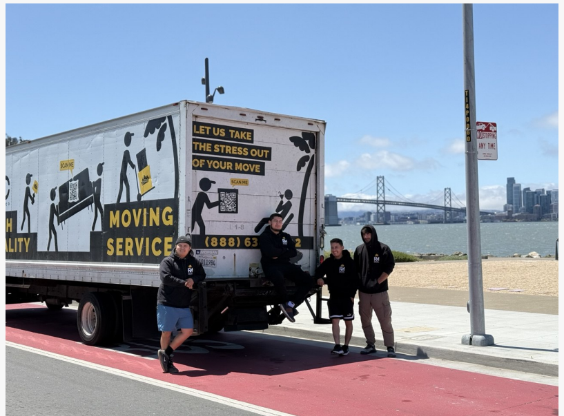
Royal Moving & Storage SF Team