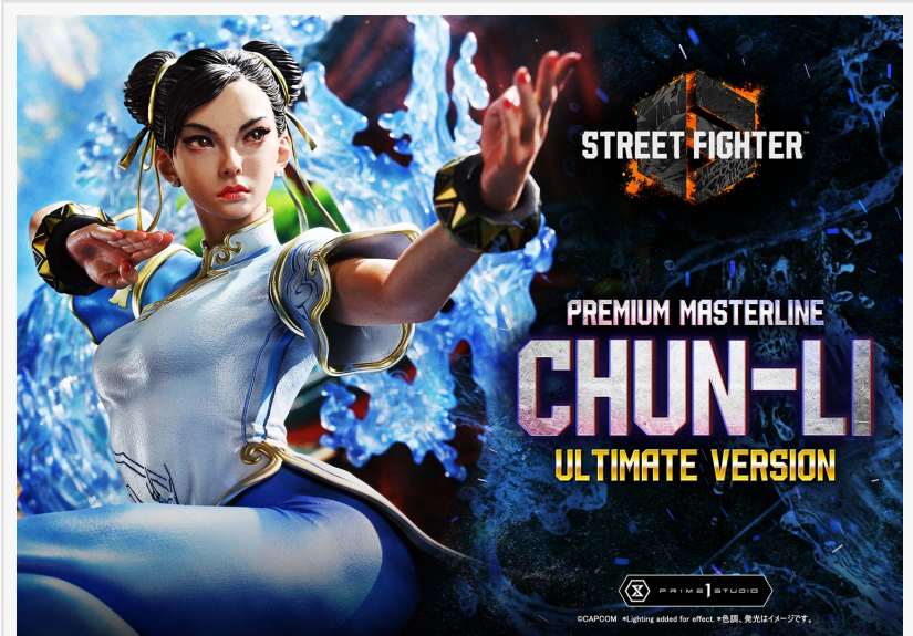
Premium Masterline STREET FIGHTER 6 Chun-Li

An alternate head with a more focused expression can be swapped in. An additional lower body posed on one leg, inspired by the activation of Soten Ranka, is also included. The statue can be displayed in combination with the splashing Effect Wall for a more