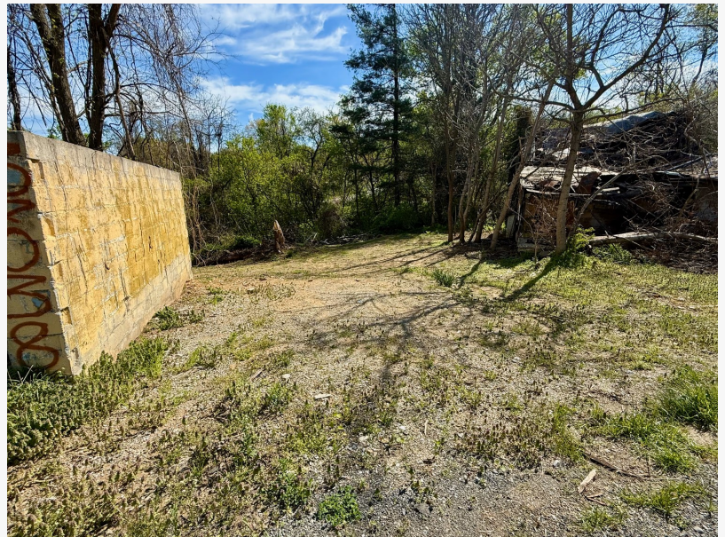
37038 Pinehill Ln., Hillsboro, VA 20132

This press release can be viewed online at: https://www.einpresswire.com/article/911893793