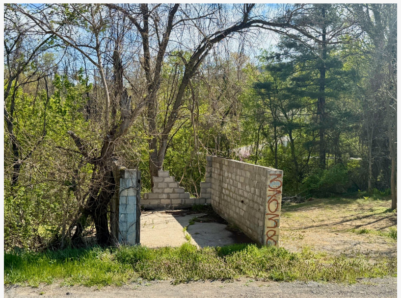
37038 Pinehill Ln., Hillsboro, VA 20132