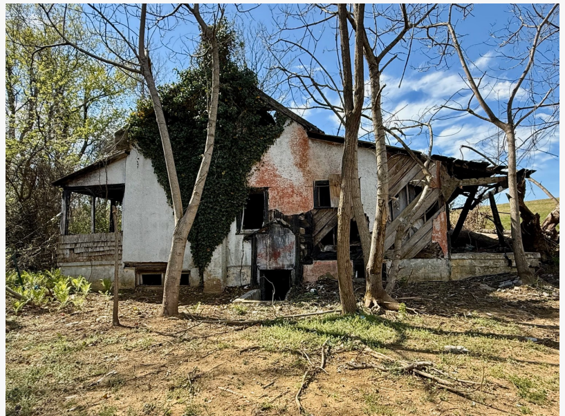
37038 Pinehill Ln., Hillsboro, VA 20132