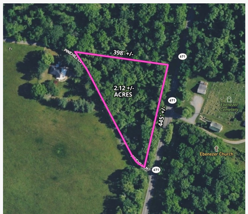
37038 Pinehill Ln., Hillsboro, VA 20132