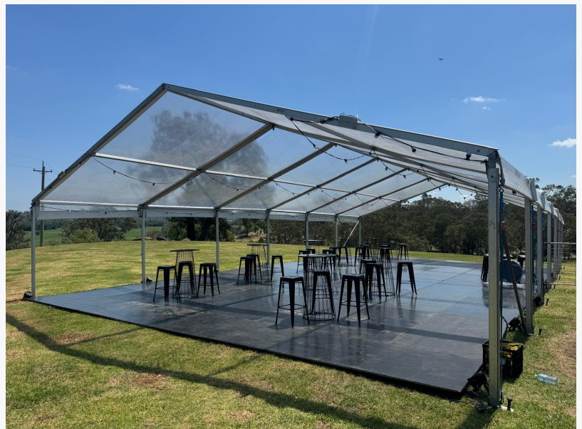
Clear marquee hire Sydney and Melbourne