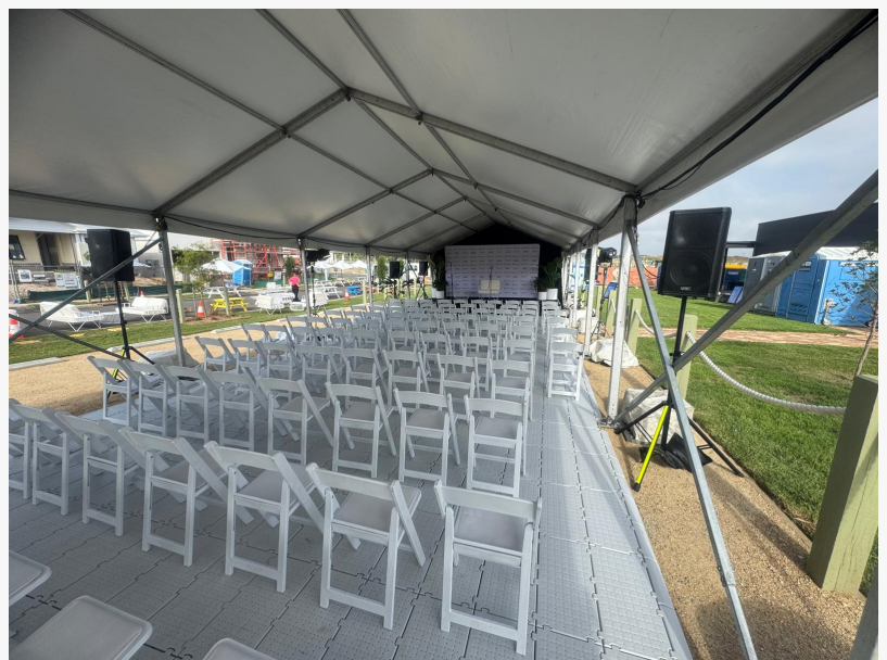
marquee hire Sydney and Melbourne

However, Liri has been able to offer something that no other provider could, which was a complete willingness to sit down with us and custom design products to suit our client's needs. Whilst other marquee providers had offered minor adjustments, only Liri was