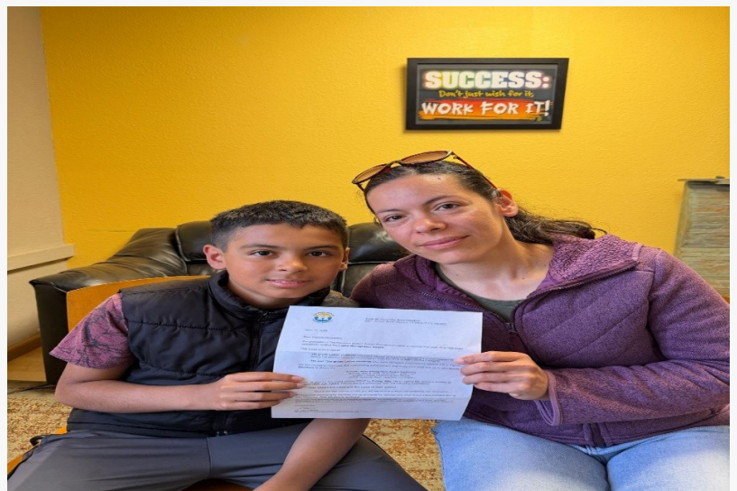
Latino Recognition Award