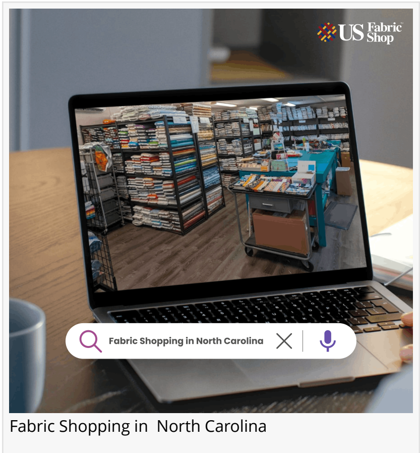
Fabric Shopping in North Carolina

The Riley Blake Confetti solids collection is part of that category. It offers a wide range of colors and is commonly used in quilts that require clear lines and balanced layouts. Solid fabrics also help highlight patterns and shapes without adding visual noise.