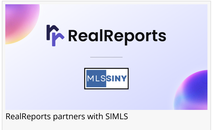
RealReports partners with SIMLS