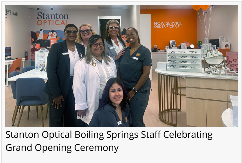
Stanton Optical Boiling Springs Staff Celebrating Grand Opening Ceremony

BOILING SPRINGS, SC, UNITED STATES, May 13, 2026 /EINPresswire.com/ -- (May 11, 2026) — Stanton Optical, a leading provider of affordable and accessible eye care, is proud to announce the grand opening of its newest location at 4384 SC-9. This is Stanton Optical's 14th location in South Carolina, reinforcing its commitment to Making Eye Care Easy across more than 300 stores nationwide .