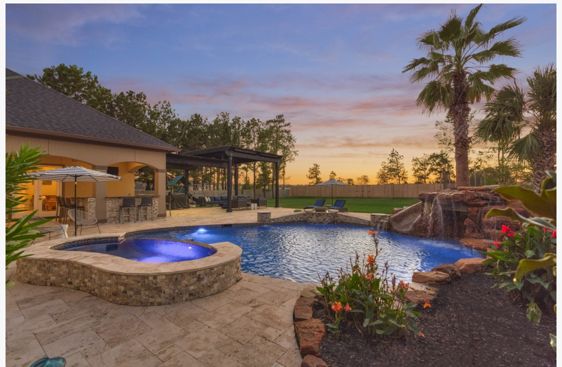
18823 Quiet Water Way Resort-Style Pool and Outdoor Living Area

As the Montgomery and Lake Conroe real estate markets continue attracting relocation buyers and second-home purchasers, properties offering privacy and lifestyle amenities remain highly desirable. Grand Harbor has become particularly attractive to homeowners who want gated security, larger homesites, and convenient access to water recreation while remaining close to dining, shopping, and entertainment options throughout the Lake Conroe area.