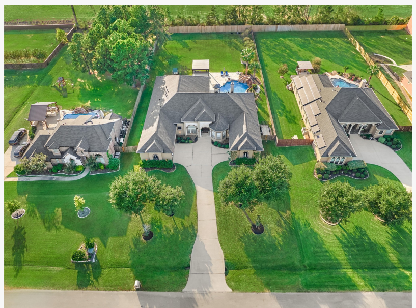
18823 Quiet Water Way in the Grand Harbor Community

The kitchen was specifically designed for entertaining with two large islands, abundant cabinetry, a walk-in pantry, and extensive counter space. Additional features include a dedicated office, game room, oversized bedrooms, walk-in closets with built-ins, and three garage bays with enough room for vehicles, boats, or recreational equipment. The open layout and single-story design also appeal to buyers looking for long-term functionality without sacrificing luxury.