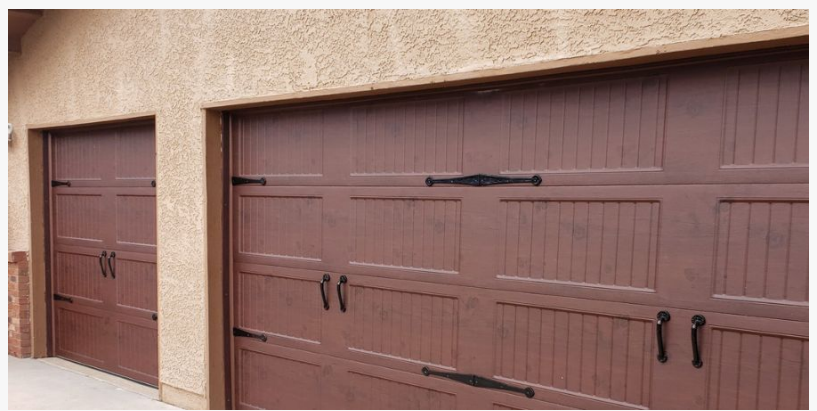
New Garage Door Installation in Las Vegas

Homeowners are encouraged to pay close attention to any changes in garage door performance