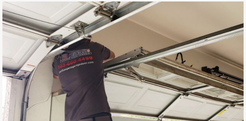
Garage Door Technician Fixes Garage