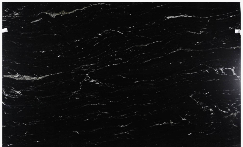
premium countertop slabs