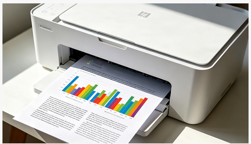
The Results of Using True Image: The Proof

True Image is a global leader and trusted supplier of premium compatible printer inks and toner cartridges. Founded in 2014 by engineers with over 20 years of industry expertise, the brand is dedicated to providing high-yield, automated-precision printing solutions. Serving 27 countries across North America and Europe, True Image combines OEM-level quality, extensive brand compatibility, and industry-leading customer service to deliver 100% satisfaction to home and