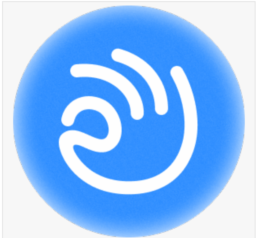
Dokie AI Logo

/EINPresswire.com/ -- Dokie AI , an AI presentation maker focused on business-ready PPT creation, has released a new version powered by ChatGPT Images 2.0. This update improves the product's AI image generation capability, enhances the visual quality of slides, and upgrades the overall structure of generated presentations. The new version is designed to solve two common problems in AI presentation creation: weak visual relevance and unclear deck structure. Many AI-generated presentations can create slides quickly, but the final result often still needs heavy editing. Some slides may look generic, while others may not connect well with the main topic. Dokie AI's latest update aims to make AI-generated presentations more polished, more coherent, and easier to use in real work scenarios.