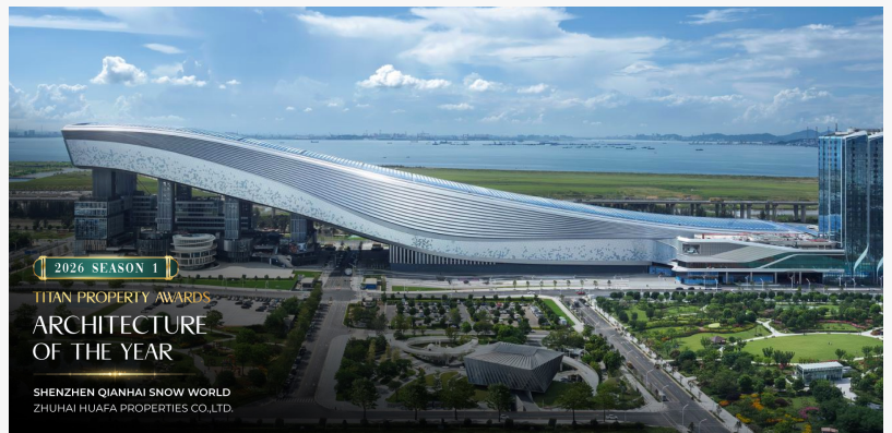
2026 TITAN Property Awards S1 Architecture of the Year - Shenzhen Qianhai Snow World by Zhuhai Huafa Properties Co.,Ltd.