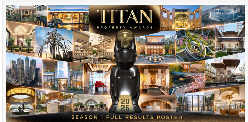
2026 TITAN Property Awards: Season 1 Full Winners Announced

NEW YORK, NY, UNITED STATES, May 15, 2026 /EINPresswire.com/ -- The TITAN Property Awards has announced its Season 1 winners for 2026, recognizing a new wave of property excellence that reflects how the built environment is evolving in response to changing lifestyles, technologies, and expectations worldwide.