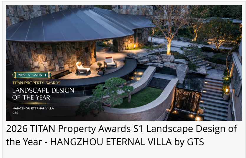
2026 TITAN Property Awards S1 Landscape Design of the Year - HANGZHOU ETERNAL VILLA by GTS

This press release can be viewed online at: https://www.einpresswire.com/article/912700393