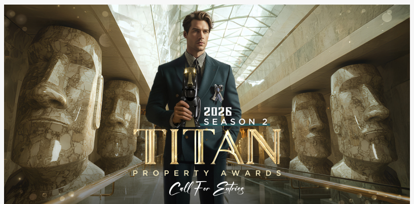
2026 TITAN Property Awards: Season 2 Calling for Entries Now

Early Bird submissions will benefit from the most favorable entry rates until June 17, with entries