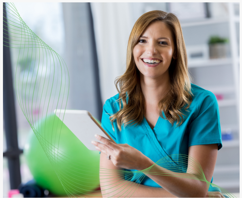
io health AI to reduce documentation errors