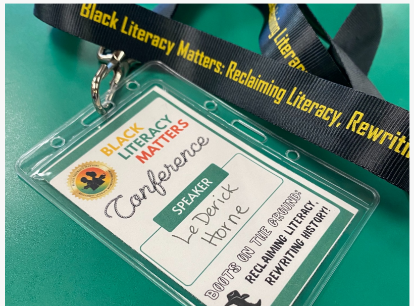
The annual Black Literacy Matters conference is an inclusive event that focuses on literacy