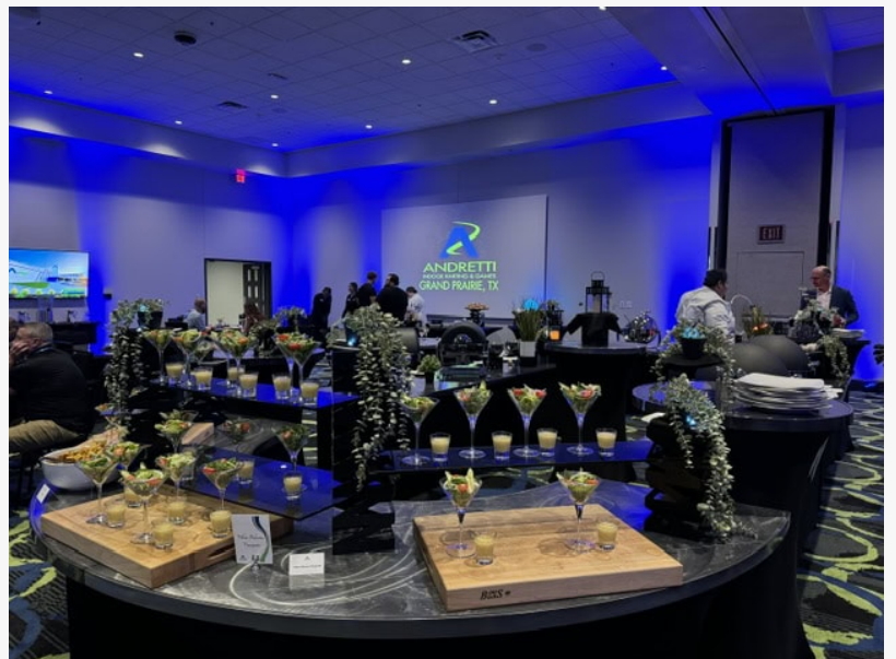
Andretti Indoor Karting & Games Large Space Event Area

The new Durham location features more than 8,000 square feet of flexible event space designed