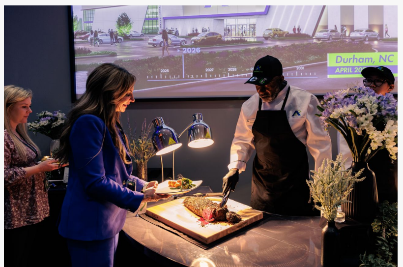
Andretti Indoor Karting & Games Event Dining

As businesses continue prioritizing employee engagement, culture building, and in person collaboration, Andretti Indoor Karting & Games is expanding its corporate event capabilities to meet the growing demand for more dynamic and memorable experiences beyond traditional meeting venues.