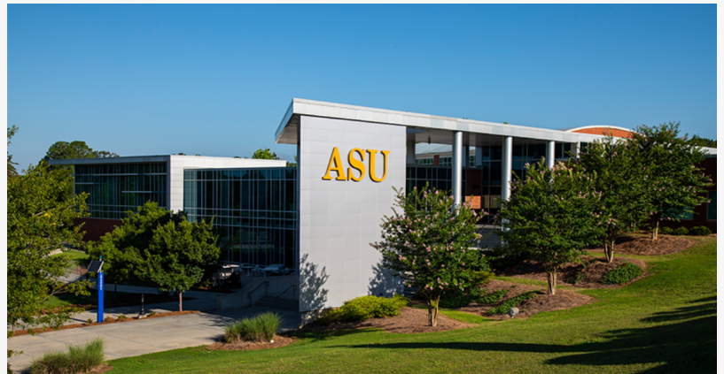
ASU C.W. Grant Student Union