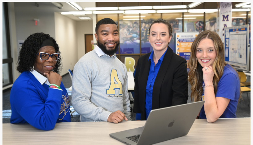
ASU Graduate Students