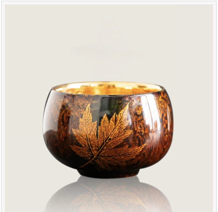
Golden Autumn | Hand-Painted 24K Gold Leaf Lacquerware Master Cup

Oriental Artisan's new collection offers several distinct silhouettes, from the wide-rimmed "Heavenly Well" shape, designed to broadcast the aroma of high-mountain oolongs, to the deep, tulip-shaped "Gathering Spirit" cup, which preserves the heat of aged Pu-erh. Each silhouette is engineered to enhance the specific profile of the tea, proving that true luxury is found at the intersection of form and function. To hold the Tea Master Cup is to experience a moment of grounded reality in a digital age—a weightless yet substantial presence that commands focus and presence.