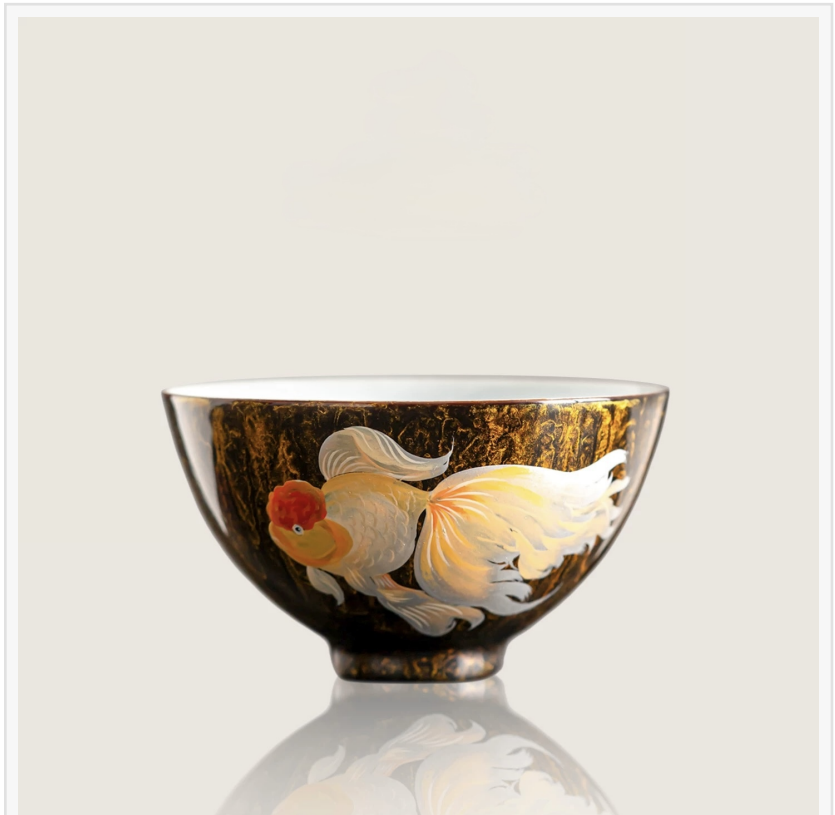
The Imperial Current | Hand-Painted Goldfish Lacquerware Master Cup

At the heart of this collection is the extraordinary substance known as Urushi or Da Qi—the natural sap of the lacquer tree. Unlike synthetic coatings or industrial glazes, natural lacquer is a living, breathing organic polymer. It does not simply "dry" in the traditional sense; it cures through a delicate process of oxidation in high-humidity environments, a chemical alchemy that has remained unchanged for over 7,000 years.